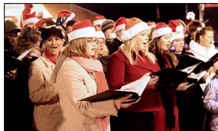
USD Carolers entertain during the Spirit of Christmas Weekend in Downtown Vermillion