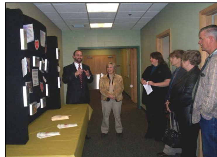
SESDAC hosted Business After Hours and an open house on Nov. 2nd.