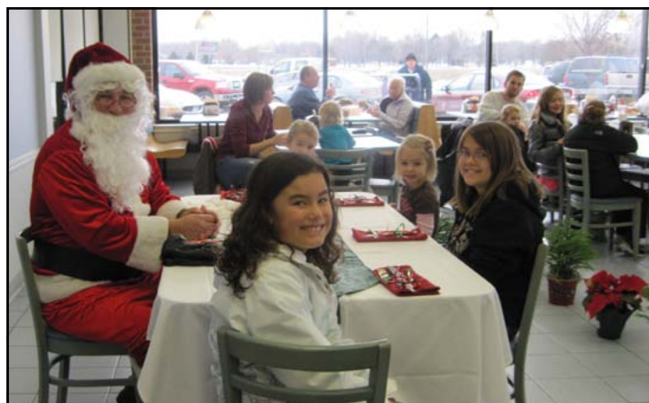
Lunch with Santa held at the HyVee Cafe