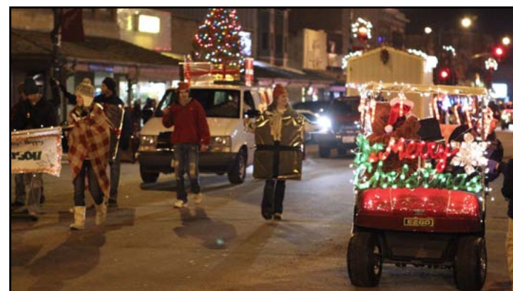
Onlookers watch the walking participants and the strolling vehicles that took part in the Parade of Lights