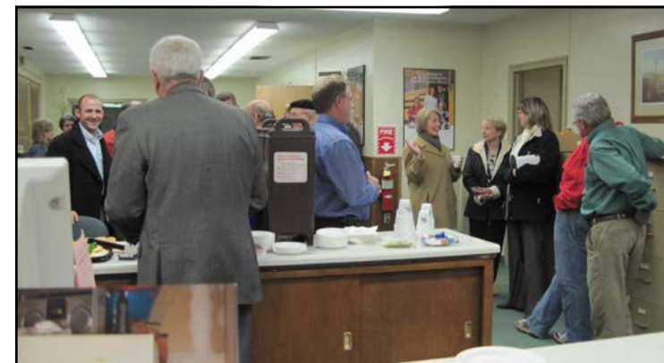
Clay Union Electric hosted Business After Hours on Nov. 23rd

Thank you to all of the businesses who hosted and to all who attended the Business After Hours these past few months. It is a great time to understand what the host business has to offer, network with your peers, meet new contacts and socialize!