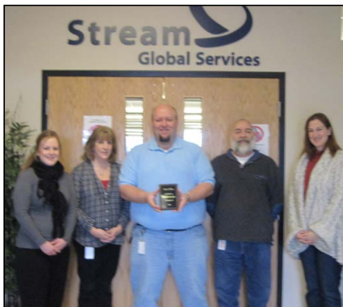
Winning Parade of Lights entry Stream Global Services!