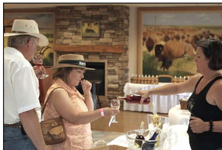
Valiant Vineyards/Buffalo Run Resort & Security National Bank of SD (Dakota Dunes) co-hosted Business After Hours on Oct. 14th.