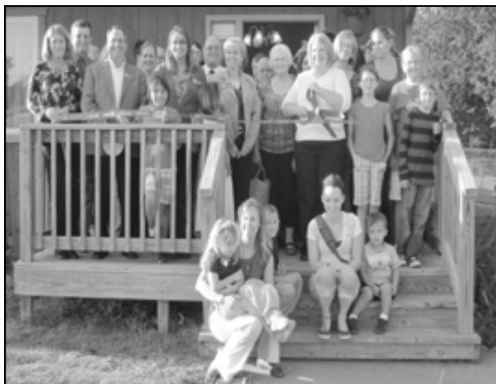
Ribbon cutting at Margo's Moppets on September 21, 2010