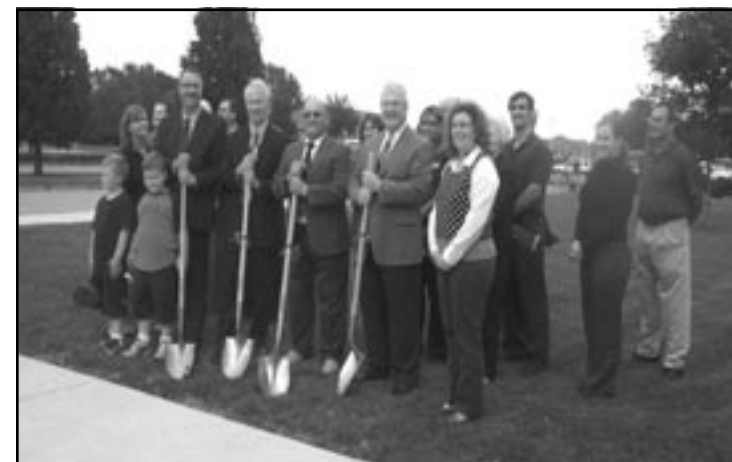
SDN Communications September 9, 2010

To follow progress on the project, go to: http://www.sdncommunications.com/stimulus