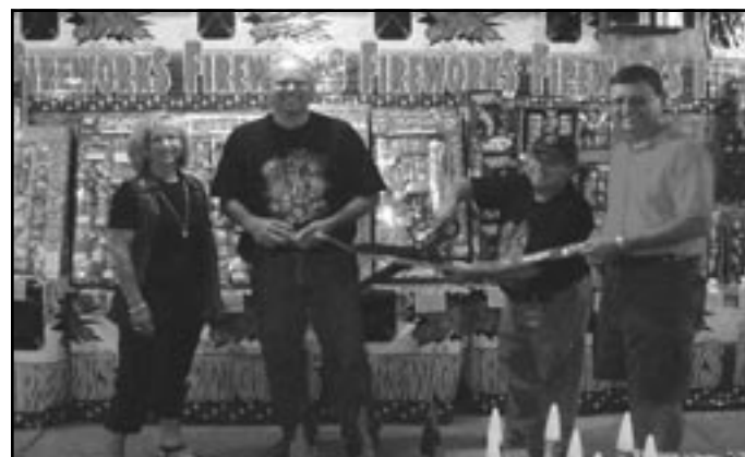
Fireworks Unlimited June 27, 2010