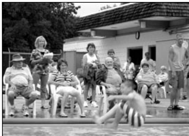
and places to get wet

PREPARING FOR VERMILLION'S FUTURE BY INVESTING IN VERMILLION NOW!