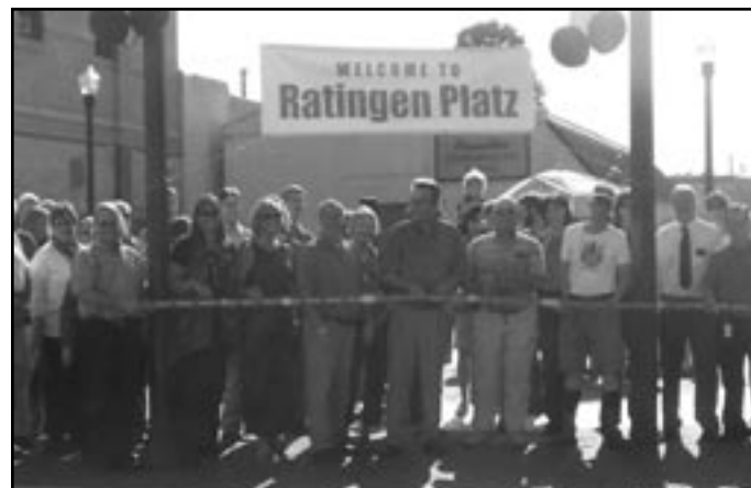
Ratingen Platz July 29, 2010