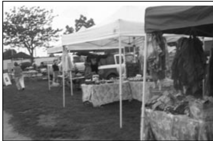
The Farmers Market