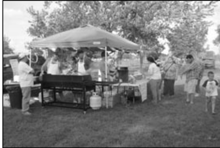
Annual July 4 th Celebration included food to be eaten . . .