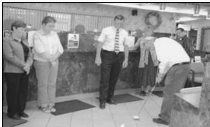
CorInsurance and CorTrust Bank