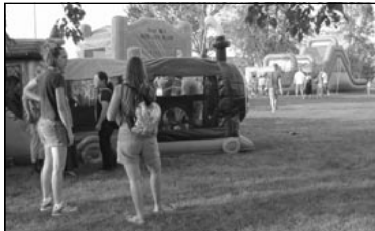
things to be jumped on . . .