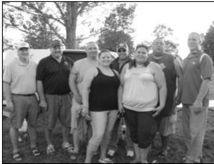
Hy-Vee Hot Dog Contest Winners