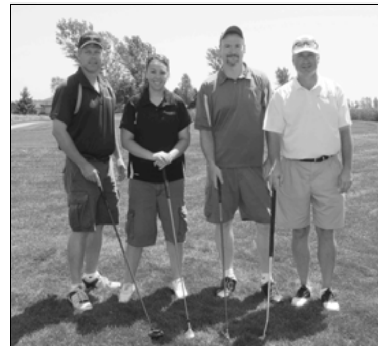
Dakota PC Warehouse team

Thank you to all of the team members, hole sponsors, pin prize sponsors, door prize sponsors and the VCDC Ambassadors for making our 2010 Golf Social a tremendous success! Congratulations to the winning team of the tournament, Dakota PC Warehouse.